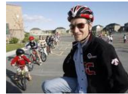
Dave Zabriskie, current USA time trial champion and Tour de France stage winner, was the guest of...