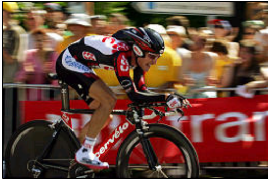
David Zabriskie, of the CSC team, speeds during the prologue of the Tour de France.