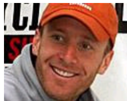
Levi Leipheimer

very special time of year, and the gift of giving a kid a bike is more than just a toy. It's a gift that literally allows you to get away; as soon as you turn a corner on a bike you're in a special place. So my hat's off to you guys for doing this so long and helping so many."