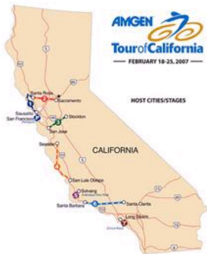
Tour of California 2007 route

The Tour of California announced specific route details earlier today for the 2007 edition, which will cover 650 miles in eight days in February. The 2007 race is expected to be tougher than the 2006 edition. The last few days of the race, when riders are more fatigued, will likely be more difficult.