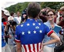
David Zabriskie (CSC)

In its first year, Bikes 4 Kids Utah, a Salt Lake City-based non-profit organization, was ranked 24th in Outside Magazine's "Outside One-hundred," a list of top newsworthy athletes, products, gadgets and bold ideas in published in its December 2006 issue.