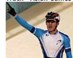
Photos from the track action in Qatar