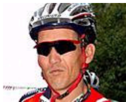
Robbie McEwen

Some 3,000 participants joined the inaugural ride in Victoria earlier this year, and the Queensland organisers hope their event will eclipse this figure. Participants can choose from a 100km ride, starting at Southbank, or a 45km out-and-back, starting in Surfers Paradise; both finishing on the Esplanade in Surfers Paradise followed by coffee, entertainment, interviews and autograph signing with the stars.