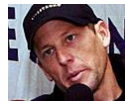
Lance Armstrong answers questions