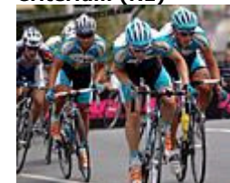
Astana demonstrates team tactics in Australia.