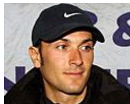
Ivan Basso

Some of the sport's biggest names lent a hand this morning to help make the holiday season a little brighter for kids in Austin, Texas. With the Discovery Channel Pro Cycling team in Austin for its annual introductory training camp, team sports manager Johan Bruyneel was joined by riders Ivan Basso, Levi Leipheimer, and seven-time Tour de France champion Lance Armstrong to support the "Bikes for Kids" program organized by local radio station MIX 94.7.