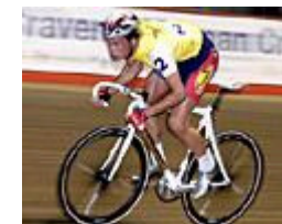
More photos from Manchester

In announcing the stages, the tour organizers noted that, "If he is true to his traditional start of season, Tom Boonen...could embark upon a new series of victories. But there is also every chance that the ex-Belgian world champion will face fierce opposition from the Italian rider Alessandro Petacchi, eager to test his finish in the Middle East after a season disrupted by injuries in 2006."